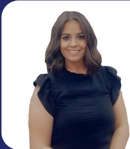
KIRBY COOL COMMUNITY IMPACT COORDINATOR